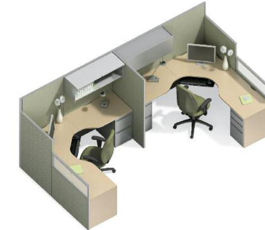
Double Clerical Workstation shown with overhead storage

66" panel configurations allow the user to build private or semi-private offices for executive, management and reception areas that maintain privacy.