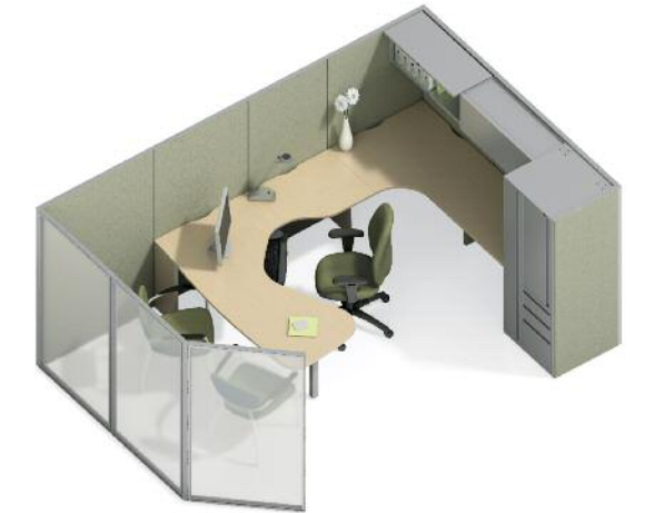
Management Workstation with frosted panel for privacy

Panels and ergonomically designed worksurfaces are configured to provide ample space and privacy for individual tasks in an open office while facilitating occasional group interaction.