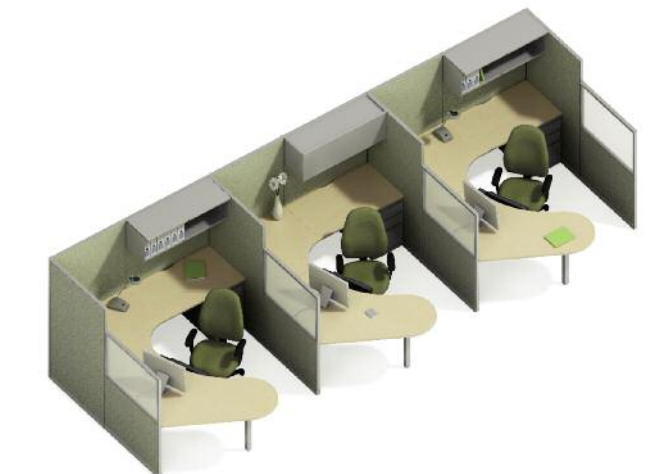
Travel Agent Workstations