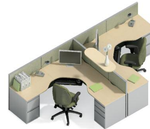
Collaborative Workstation shown with transaction top

A versatile product with many small office applications.