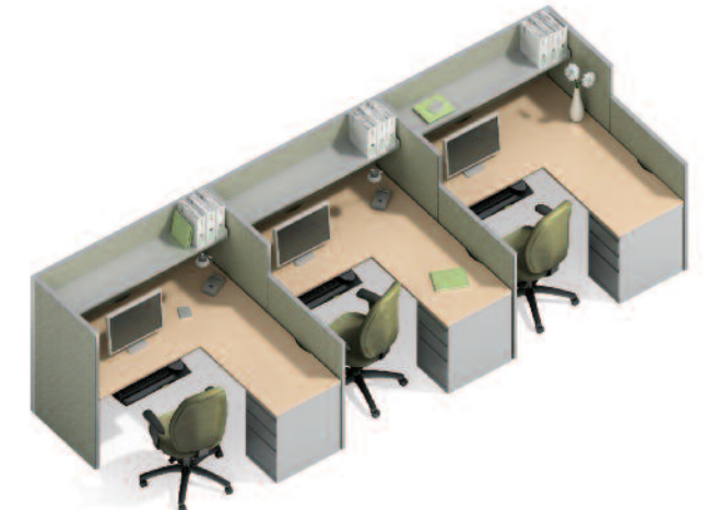
Customer Service Workstations shown with bookshelf