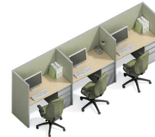
Telemarketing Workstation with a pedestal supported worksurface

Panels and ergonomically designed worksurfaces are configured to provide ample space and privacy for individual tasks in an open office while facilitating occasional group interaction.